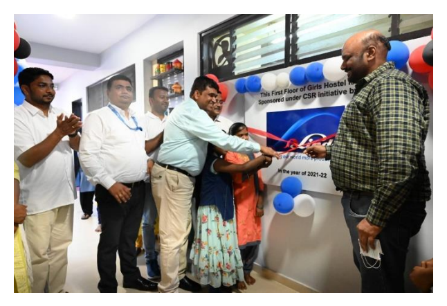
Linde India CSR Branding